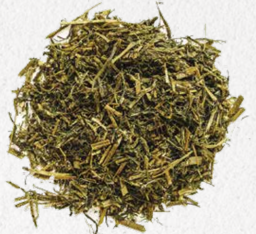
Alfalfa haylage: 14.1 kilograms*