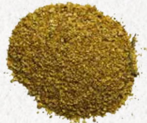
Dry corn distillers grains: 1.8 kilograms*