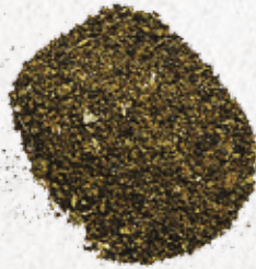
Canola meal: 1.1 kilograms*