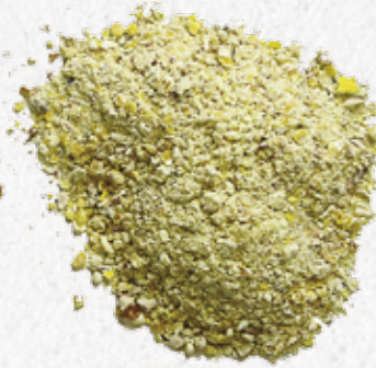
Dry ground corn: 4.9 kilograms*