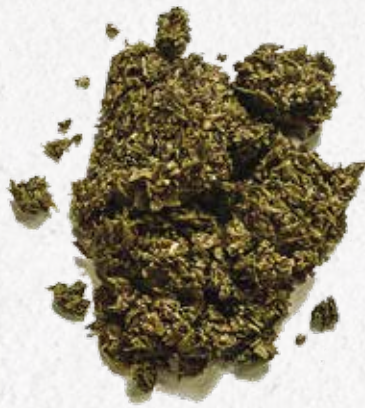
Wet Brewers grains: 7.6 kilograms*