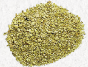
Soybean meal, 48%: 1.1 kilograms*