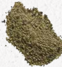
Mineral and vitamin premix: 0.8 kilograms*