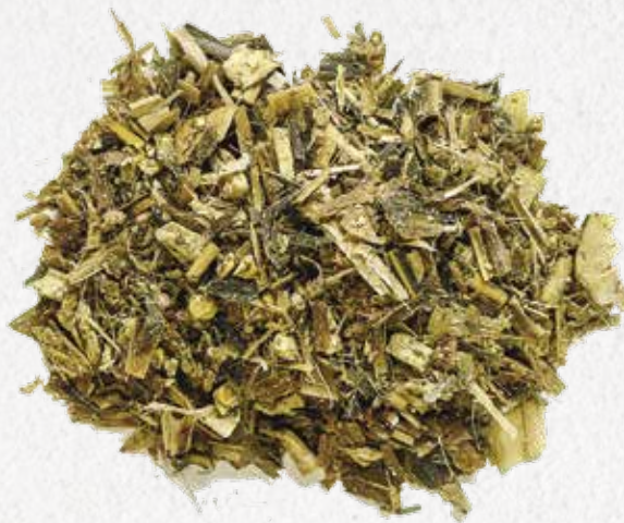
Corn silage: 28.6 kilograms*